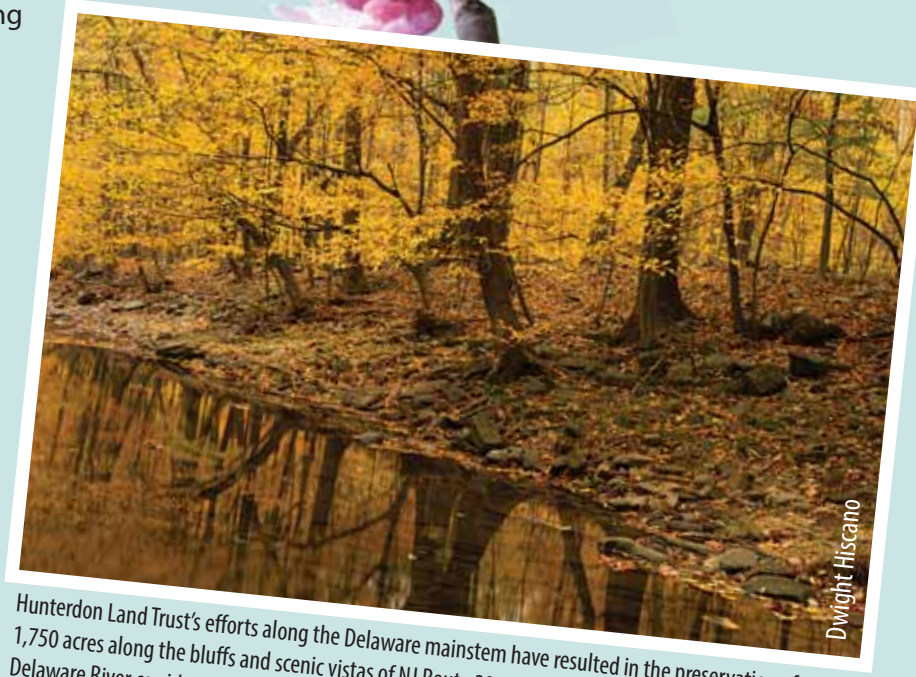
Hunterdon Land Trust's efforts along the Delaware mainstem have resulted in the preservation of over 1,750 acres along the bluffs and scenic vistas of NJ Route 29, and more than 3,000 acres in the Lower Delaware River corridor within a five year period. Photo: HLT's Lockington Preserve in NJ.