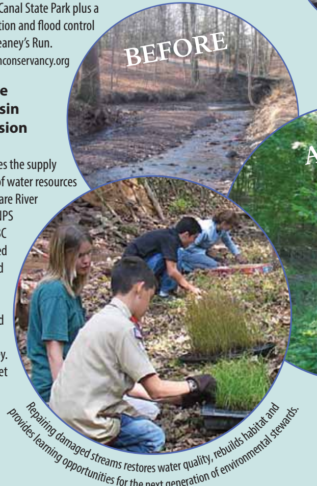
Repairing damaged streams restores water quality, rebuilds habitat and provides learning opportunities for the next generation of environmental stewards.

Delaware River Basin Commission (DRBC) DRBC oversees the supply and quality of water resources in the Delaware River Basin. With NPS support, DRBC has conducted sampling and analyses for the Lower Delaware and a freshwater mussel survey. www.drbc.net