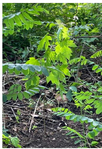
One of about 10 SPLASH dock path seedlings