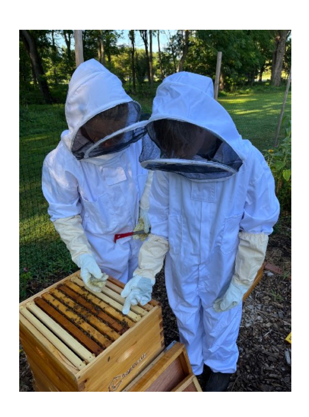
... 20,000 more in #2 Bee Castle