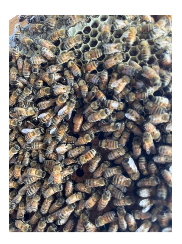
The restorative pollinating potential of one bee is exponentially multiplied by 'Her Majesty' and thousands of her worker bees.