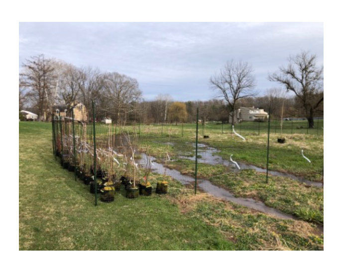
Deer exclusion fencing,trees, shrubs April 12, 2022