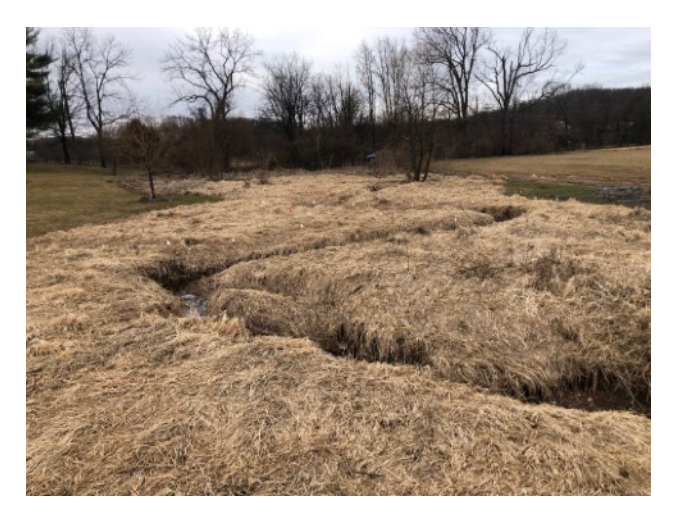
Deeply eroded and incised riparian area February 20, 2022