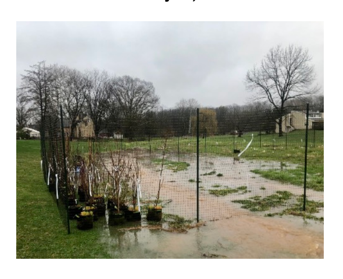
April 13, 2022